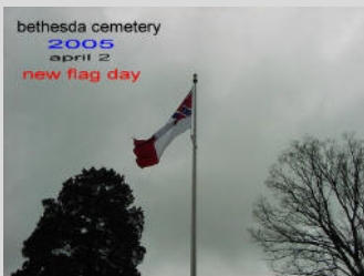
The new flag takes station.

April 2nd turned out to be the day. The faithful, but tired, flag came down for the last time and the new went up to begin its time of service. There is always something special about the first one and discussions are underway as to what will be done with the retired flag, so stay tuned.