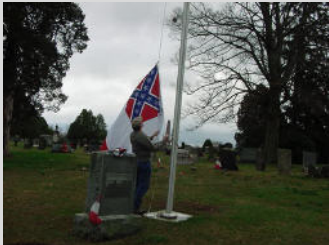
New banner on its way up!

The camp has been working for some time on the acquisition and installation of a suitable replacement to stand guard over the Confederate dead.