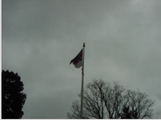
Remains of our "First" flag.

As most of you will know, our 30 foot flag pole at Bethesda Church is one of our camp's prouder achievements. However, our beloved Third National flag has come to look more like one of the tattered veterans that we see in museums than the proud banner originally placed here.